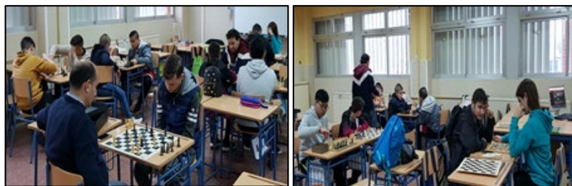
Picture 2. Photographs of the chess club at Torreblanca Secondary School.

In addition, the situations during the game have made it possible to use new words and expressions related to it that have improved linguistic competence in the new language, Spanish. We also consider that the chess sessions have had a positive impact on the development of the logical-mathematical competences, both of the immigrant pupils and of the Spanish ones. In particular we have put special emphasis on the calculation of variants of the game, that is to say, given a determined position the capacity to mentally calculate the possible movements of the opponent and the best possibilities of response.