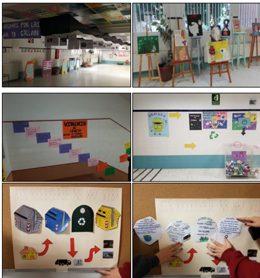
Picture 1. Photographs of the art Exhibition of the Posters and Slogans of the Art Workshop in the Facilities of Torreblanca Secondary School.

It should be noted that, given the playful and participatory atmosphere of the activity, coordination was generally very good and attitudes towards the new colleagues from different countries were also very positive. With regard to productions that have resulted from the activity, we would like to highlight some interesting creations, such as the use of elements of the building to construct metaphors, as in the case of the staircase decorated with slogans.